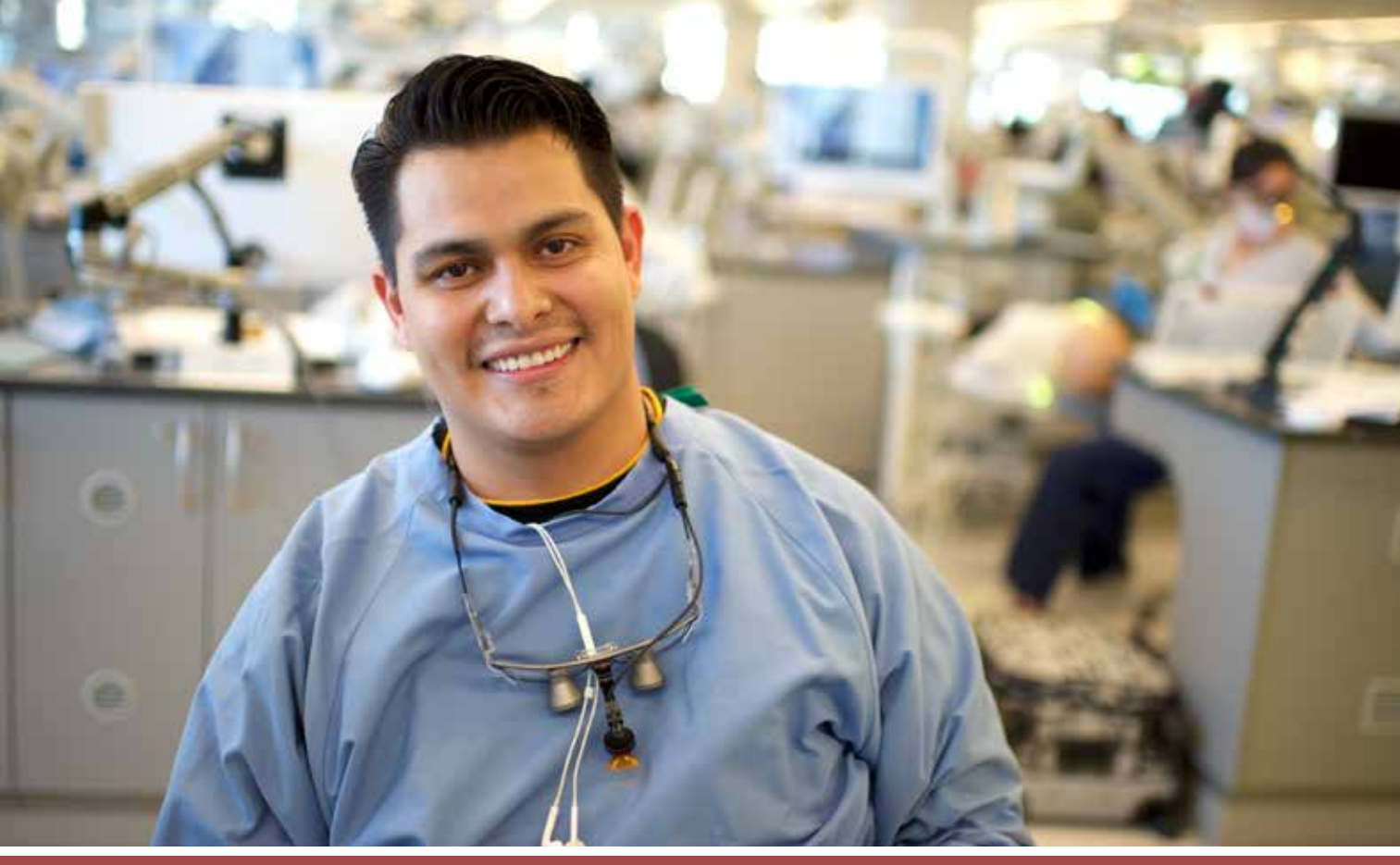
The premier RDAEF program in Northern California Course begins September 18, 2021